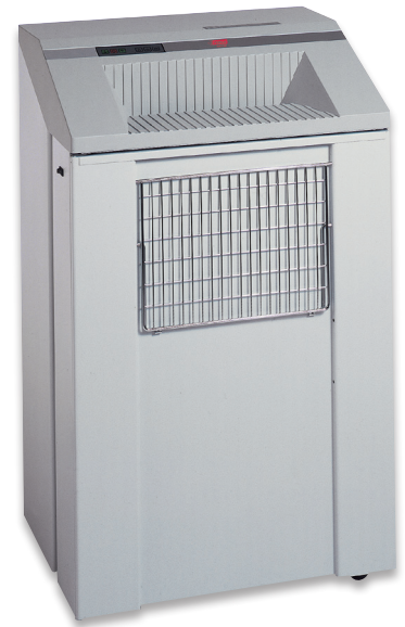
W/D/H 70 x 55 x 112 cm